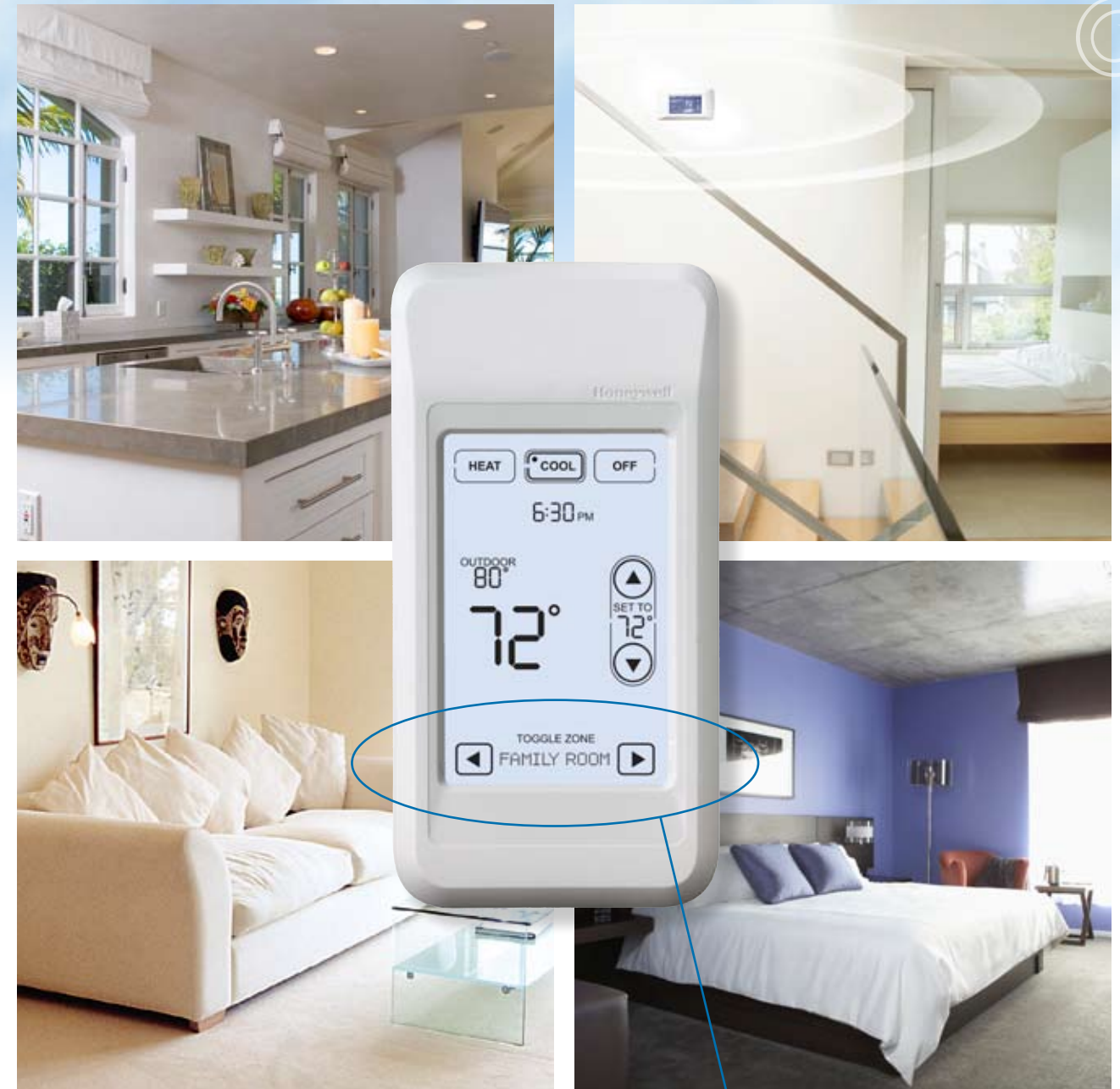
Toggle between zones to set the temperature in any zone from anywhere in the home

The Portable Comfort Control also maintains the schedule from your programmable thermostat. Easily adjust the temperature setting before bedtime to set-back for energy savings after you fall asleep — or turn the system off for easy overnight energy savings.