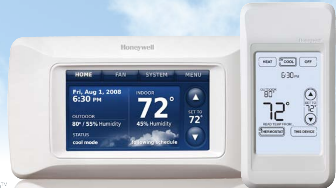
Prestige™ HD Thermostat