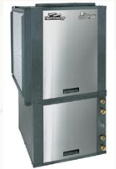
Tranquility 20™ Unit

What can you do to protect your family from this costly trend? Reduce your consumption of energy. You can improve your home's 'energy efficiency' with better appliances, more insulation, and newer or fewer windows...but did you know that over 50% of your utility costs come from heating, cooling, and hot water? Now that's something you can control...it's called the Tranquility20™ geothermal system from NextEnergy.